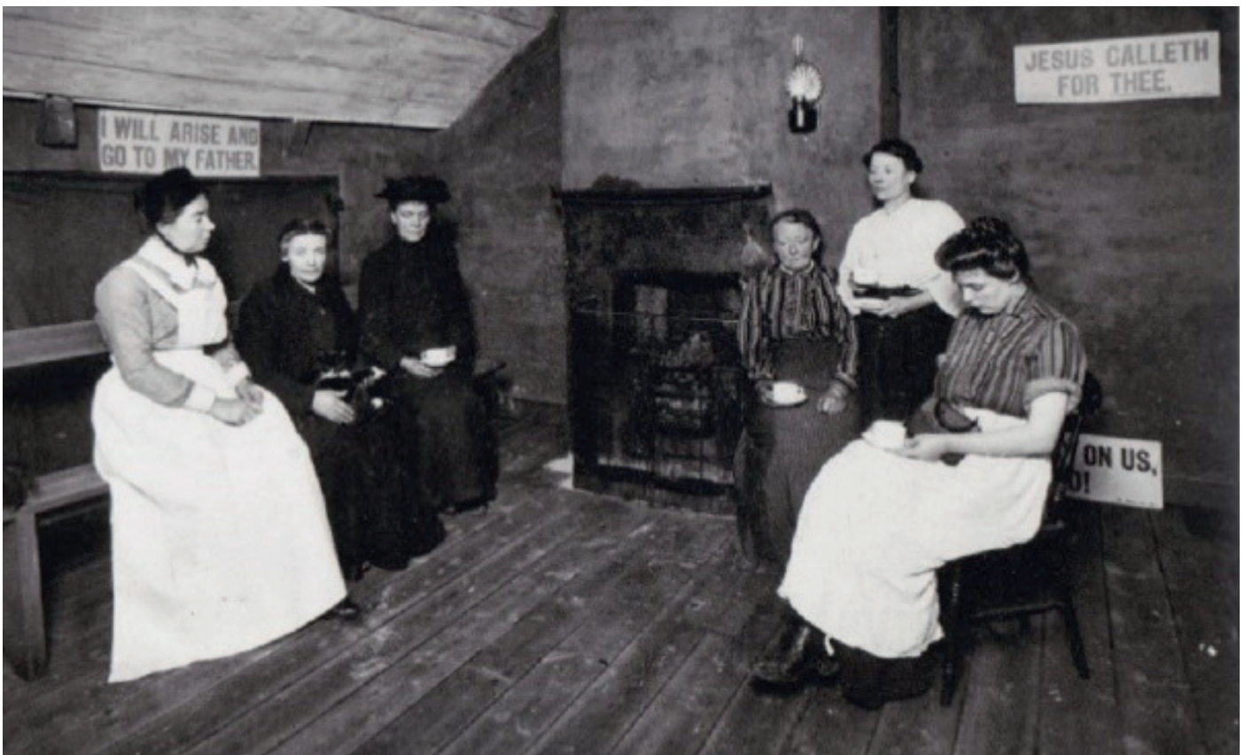
The Westminster women's 'Open All Night' project at the back of Peterhouse, 1911.