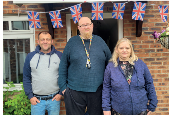
Residents at St Ambrose Court enjoy community events funded by CHT

We know the names and hear the stories of all the people that we help. The grants we give them are often quite small, but they make a big difference to their lives.