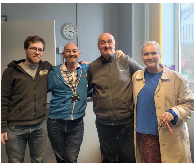
Residents at a scheme CHT supports. Some residents may otherwise be homeless and are now rebuilding their lives.

We pay for one-to-one counselling sessions; for transport to NHS appointments; for gym membership; for new well-fitting clothes; for toiletries; for identity papers; for musical instruments, cameras, drawing materials and journals; and for anything else that might help someone to rebuild their self-confidence and hope for their future.